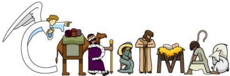
CHRISTMAS IS THE CELEBRATION OF THE BIRTH OF JESUS, THE SAVIOUR OF MANKIND

If you can donate a basket, please bring them to the church by Sunday the 7 th .